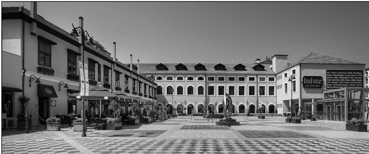
Figure 4. Samsun Tobacco Factory (after restored).

An important part of the historical building heritage in the city is Samsun Tobacco Factory in Kale District. Founded in 1887, the factory is one of the first cigarette factories in Anatolia. In the second half of the nineteenth century, it was established by the French (registrar's office), which had the privilege of buying and selling tobacco at that time with the development of tobacco agriculture and trade in Samsun. For more than a century (1887-1994) the factory building, where production was maintained, is an important witness to the historical identity of the city. Many people from Samsun worked in this factory and retired. This historical building, which forms nostalgia for the city's inhabitants in the city center, has been restored after being abandoned for a long time (Figure 4).