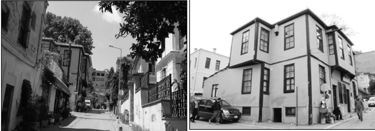
Figure 5. A building group in the neighborhood of Kale (Art Street)

built on two floors of the ground, and the interior walls of the facade are made of chunking brick in plasterboard. The examples of civil architecture in the city are better preserved than other public dwellings. These structures, which are generally considered in the central part of the city, have been preserved by both their owners and most of them by the central and local authorities due to the fact that most of them are public. Former French Consulate building in Samsun, Provincial Culture Directorate building, Directorate of Cultural and Natural Heritage Preservation Building, Çarşambalı Association Building, Elmas Hanım Mansion.