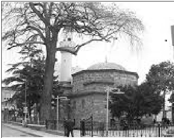
Figure 2. Yalı Mosque

Although Samsun is a city founded by Turks, it has become a city where people from different cultures and nations have come and settled. Especially after the second half of the 19th century, with the development of trade in the city, Greeks and Armenians and a number of European merchants settled in Samsun (Darkot, 1966; Yolalıcı, 1998). Non-Muslim population they built structures such as churches, schools, dwellings, graveyards reflect their culture and faith values. The Mother Dolarosa Church (1846), located on the 100th Anniversary Avenue in Ulugazi District, has a special importance in the historical buildings of the city. The priests of the Italian Capucin, who were expelled from Tbilisi Church by Tsar Nicholas in 1845, first founded the Santa Mariya Church in Trabzon and the Mater Dolorosa Church in Samsun. Today, the church, which is open to worship, has existed as a good example of people from different religions and cultures living together in the city since the past (Figure 3).