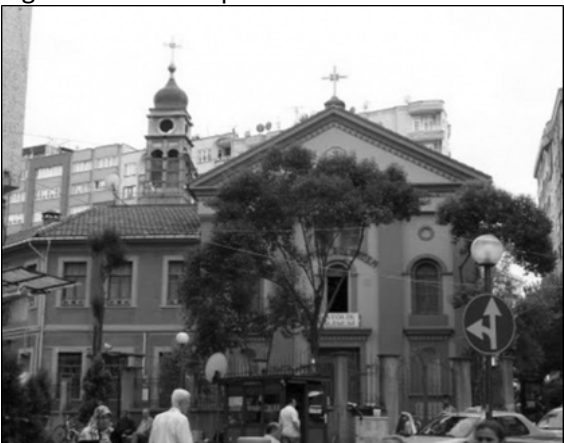
Figure 3. Mater Dolorosa Church